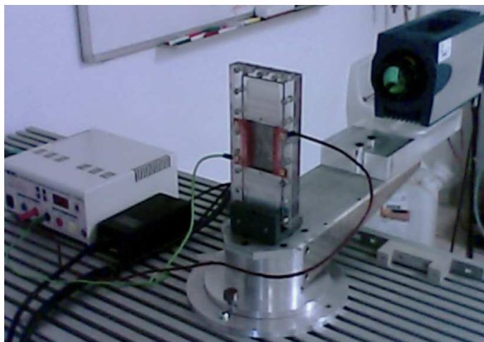
Fig. 2. Experimental device